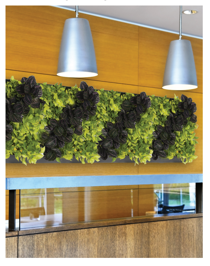
Four PP-3232's arranged horizontally