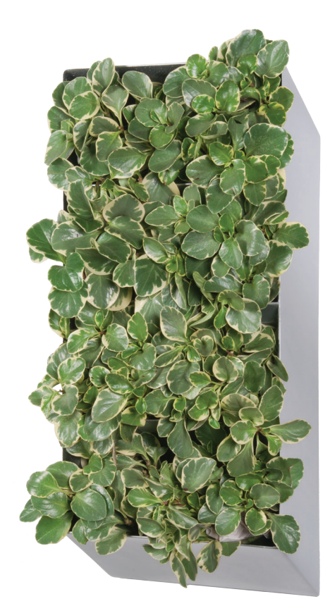
Available in 42 finishes

Simply add 3-4 wicked plants to each shelf and fill each shelf with water. Watering cycle is normally 1-2 weeks.