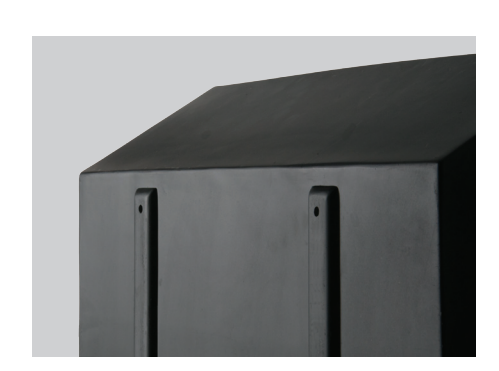
Rails on back allow for air circulation