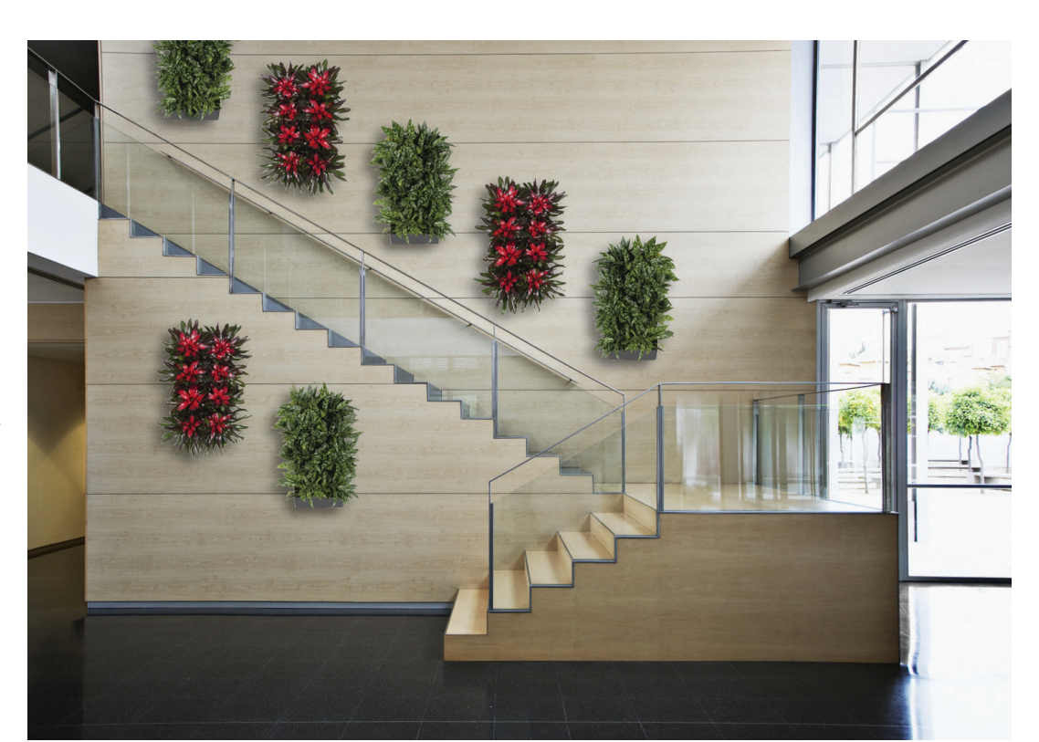
Seven PP-1632's arranged diagonally