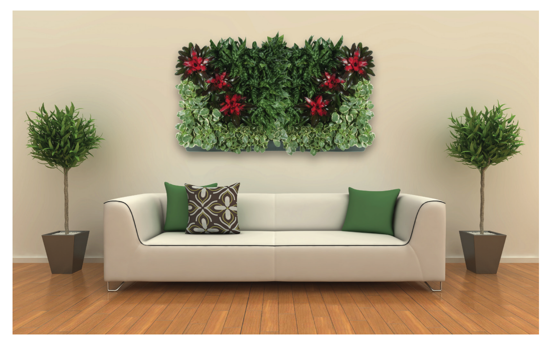
Two PP-3232's arranged horizontally